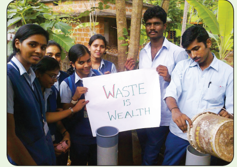
NSS volunteers installing pipe compost unit as a part of "Waste is wealth" project