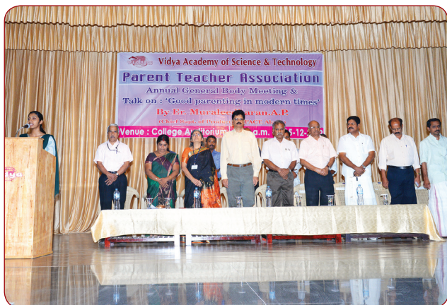
Dignitaries on the dias during the meeting