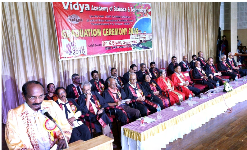
Dr. K. Sivan delivering the Convocation address