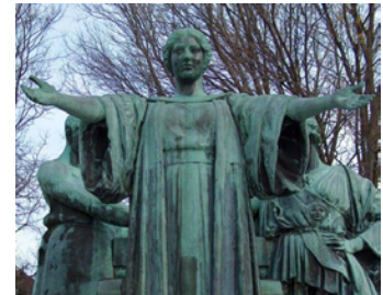
Statue of alma mater at the University of Illinois

The ritual of graduation adds a touch of melancholy and pride to the rite of passage. Parents watch their children pass to a new stage of life, and graduates feel satisfied in their accomplishments.