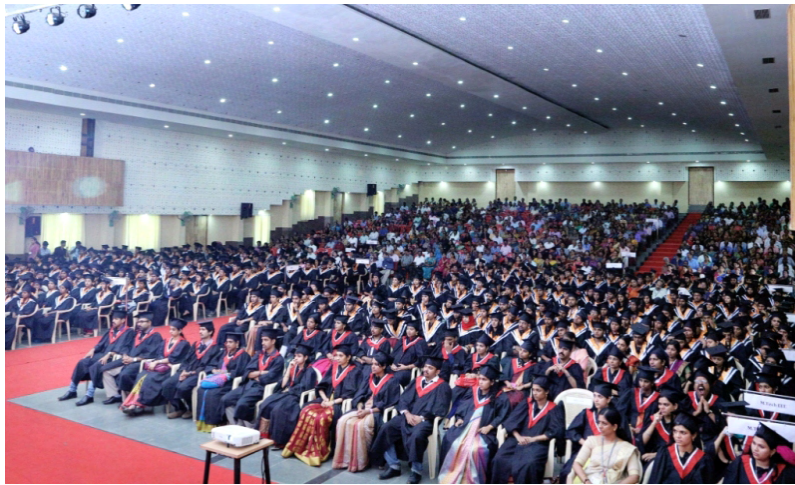
A view of the participating students