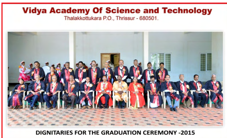
Dignitaries for the Ceremony